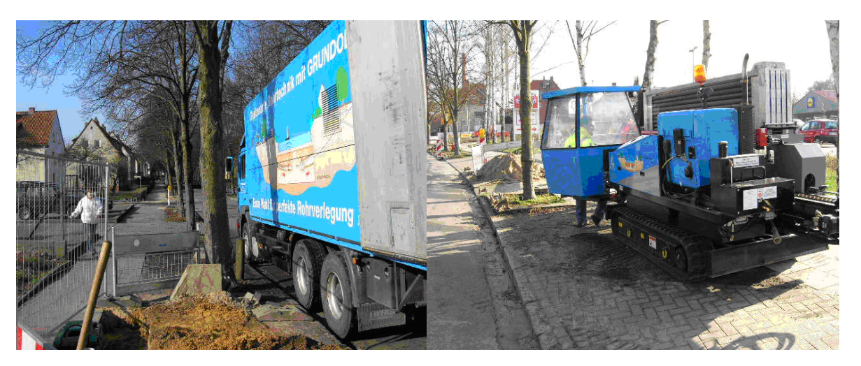
Fig. 3. Old cable replacement project in Uelzen. The cable path is situated beneath the alley of trees.

lengths had 100 to 120 m each, every 30 m, and an intermediate pit for removing pieces of the old cable was established. These short removal distances were chosen because of the great weight of the cable (34 kg/m) and the thin cable coating (risk of oil emerging due to overstraining of the coating). The defective cable was removed from the complete track without any damage and could be collected in large containers for recycling. The customer and commissioned company were extremely pleased with the applied method, and the department of the environmental protection was also very satisfied with the results.