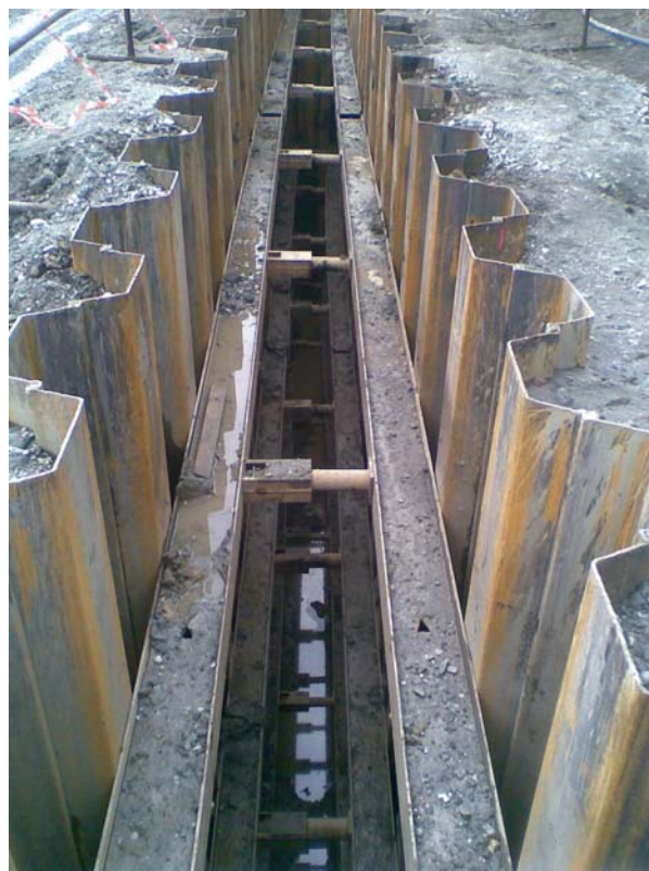
Fig. 3. Construction of excavation for a drainage rib supported by sheet pile walls.

Work was performed in six sections, which were prepared beforehand according to work schedule and each was closed by a transverse wall. Maximum level of excavation was always 0.5 meters under then installed level of spreading structure. One spreading structure was installed at one level and subsequently