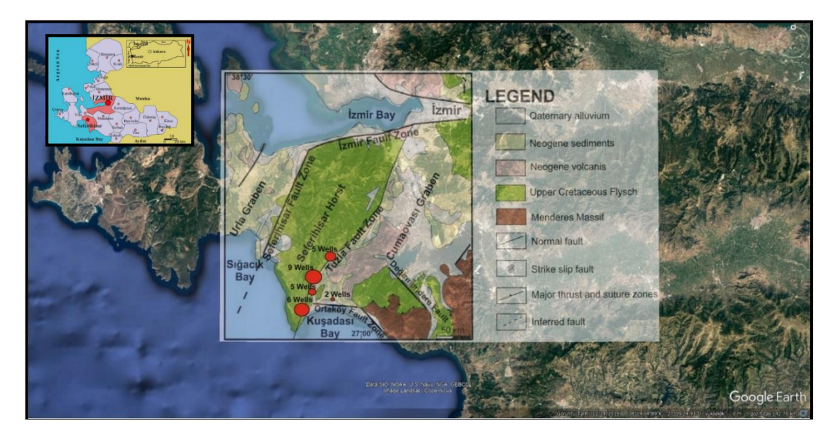
Fig. 3. Location and geological map of Seferihisar geothermal field through Google image (modified after Eşder and Şimşek, 1975; Sözbilir et al., 2008; Uzel & Sözbilir, 2008)